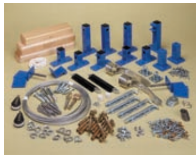
Master fixing kit – Supplied with all Spectrum, single, double & foldover climbing frames